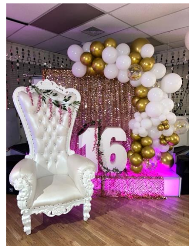
G. Single throne with Number display