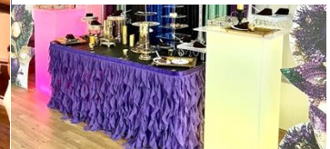
F. Decorated Dessert table