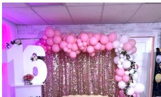
L bench Crème, black or white