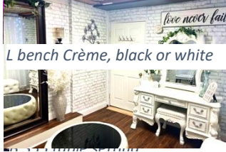
J VIP room